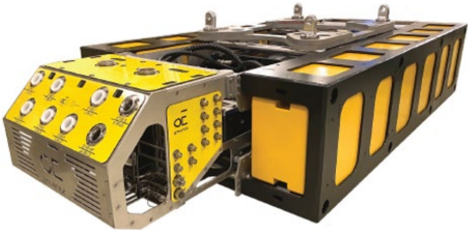
Skid with fixed front